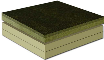
Available Flat or Tapered